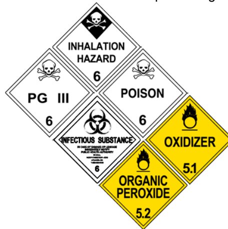
Examples of HAZMAT Labels. Figure 9.2

Shippers put diamond-shaped hazard warning labels on most hazardous materials packages. These labels inform others of the hazard. If the diamond label won't fit on the package, shippers may put the label on a tag securely attached to the package. For example, compressed gas cylinders that will not hold a label will have tags or decals. Labels look like the examples in Figure 9.2.